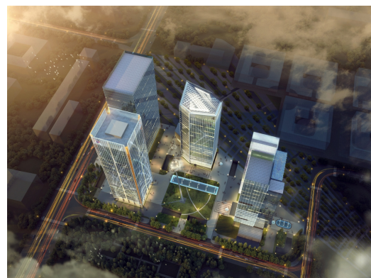
乌兹别克三座银行办公总部项 Project of the headquarters of three banks in the Republic of Uzbekistan Проект головного офиса трех Банков в Республике Узбекистан