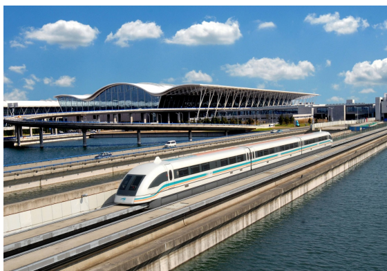
浦东国际机场 Pudong International Airport Международный аэропорт Пудун