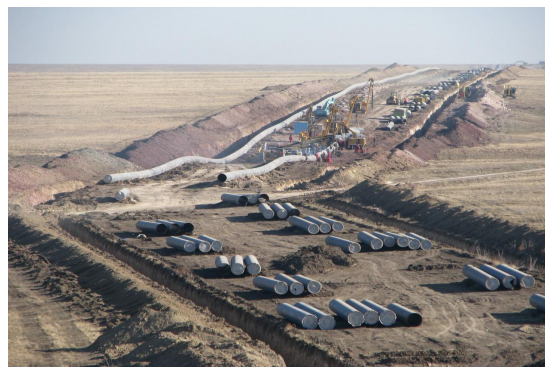
中油国际管道公司中国-中亚天然气管道 THE CENTRAL ASIA-CHINA GAS PIPELINE-2