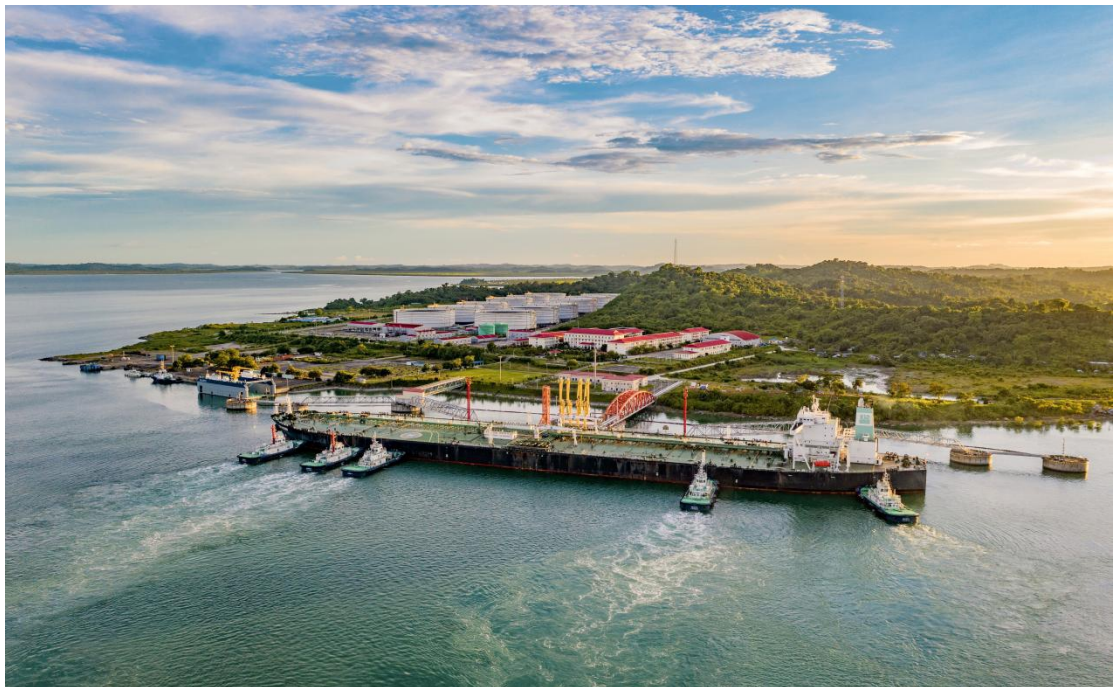
中油国际管道公司中缅管道马德岛 30 万吨级原油码头 Crude oil port in Made Island, with receiving capacity up to 300,000 DWT, MYANMAR -CHINA OIL & GAS PIPELINE