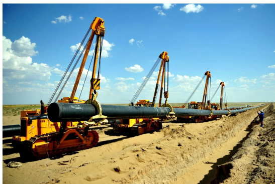
中油国际管道公司中国-中亚天然气管道 THE CENTRAL ASIA-CHINA GAS PIPELINE-1

SINO-PIPELINE International (SPI) is a CNPC company specializing in overseas oil & gas pipeline operation. It runs 11 subsidiaries, business of which covers six countries including Uzbekistan, Kazakhstan, Tajikistan, Kyrgyzstan, Myanmar and China. SPI is currently managing 6 natural gas pipelines, 3 crude oil pipelines and 1 crude oil port in Made Island, which is capable of receiving VLCCs up to 300,000 DWT. All the pipelines add up to over 11,000 kilometers in length, with an annual oil & gas transmission capacity of 105 MTOE. SPI has built two major strategic energy corridors on the Northwest and Southwest of China. It is playing a pivotal role in securing China's energy supply, optimizing national energy consumption structure, as well as echoing the nation's call on Building a Beautiful China. As a pioneer and loyal practitioner of the "Belt and Road" Initiative, SPI, by its unrelenting efforts, is continuously contributing to the deepening of China's cooperation with Central Asian and Southeast Asian nations in the energy sector.